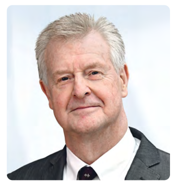
First elected in 2018 Most recently elected in 2019 Chairman of the Research & Development Committee since 2018

Chairman of the Research & Development Committee