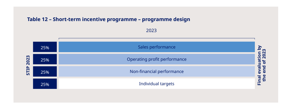
Table 13 below shows the corporate targets set by the Board and the individual targets for the CEO as set by the Chair of the Board in the beginning of 2023. Threshold and maximum performance targets were set for each metric at the same time. Performance below the threshold level for a metric would result in 0% pay-out for that metric. Performance above the maximum performance target would result in maximum incentive pay-out for that metric. The table also includes the achievement as assessed by the Board in the beginning of 2024.

The STIP 2023 is a one-year cash-based incentive programme, cf. table 12 below. The maximum pay-out cannot exceed 12 months' base salary for the CEO and nine months' base salary for the executive vice presidents. Corporate targets have a weighting of 75%, apply to all executives and are aligned to Novo Nordisk's Strategic Aspirations 2025: Purpose & Sustainability, Innovation & Therapeutic Focus, Commercial Execution and Financials. The individual targets have a weighting of 25%. The corporate targets are set and progress is assessed by the Board, while the individual targets are set by the Board in relation to the CEO and by the CEO in relation to the executive vice presidents. Target achievement is assessed by the Board.